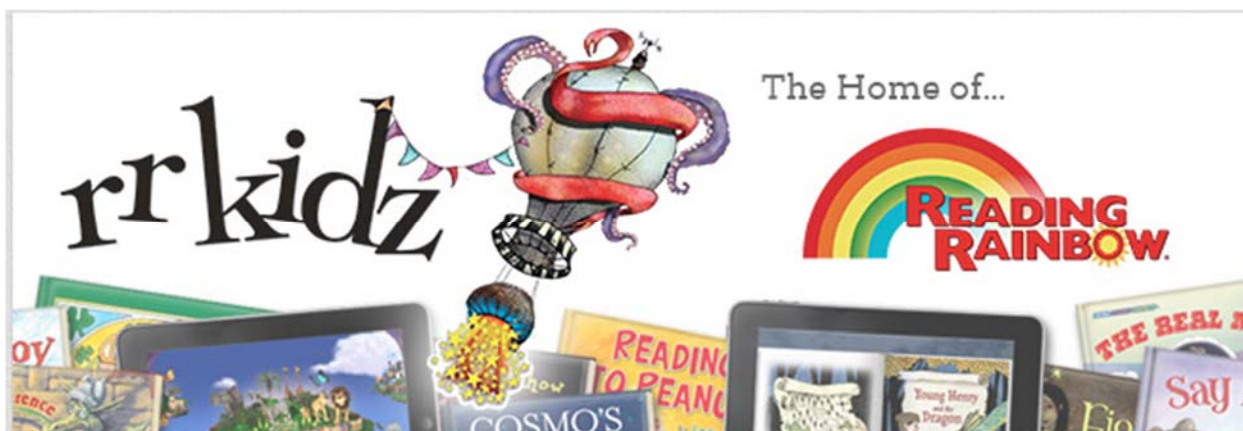
Figure 2 - Screenshot of https://www.linkedin.com/company/rrkidz on March 8, 2016