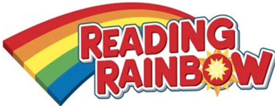
Figure 1 - The Reading Rainbow Logo

3. Over the last three decades, WNED has raised more than $45 million to develop and promote the Reading Rainbow brand. As a result of WNED’s efforts, the RR Marks have become immediately recognizable symbols of the gold standard for educational programming and the encouragement and development of child literacy.